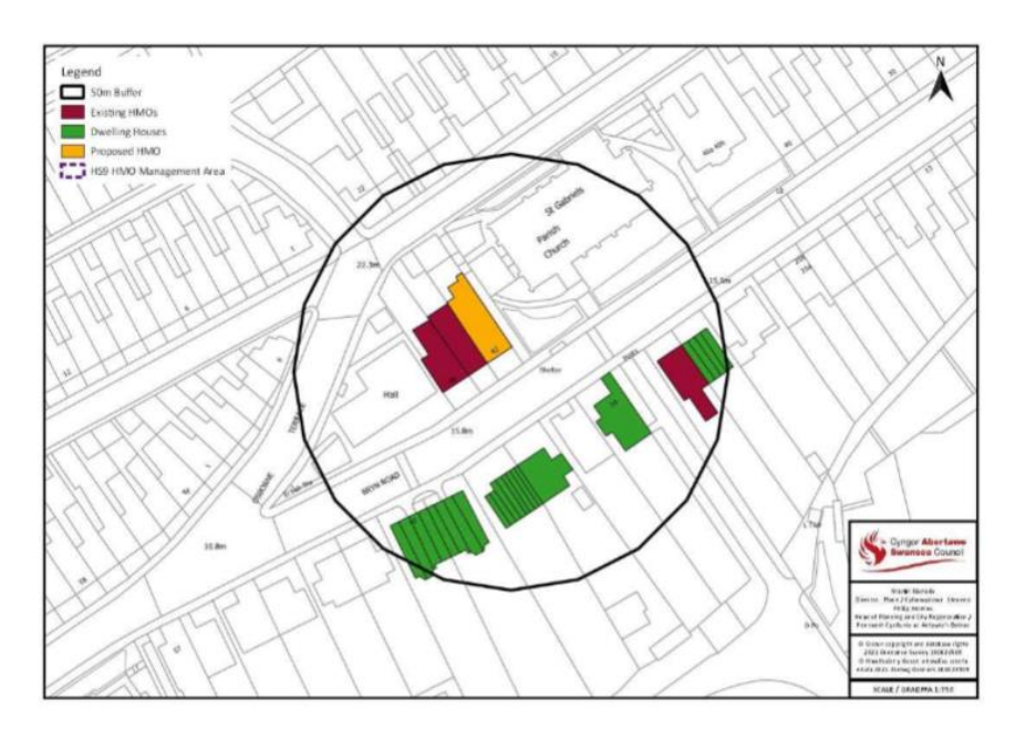
Figure 1 - HMO Concentration Radius Test

Within a 50 metre radius of the application property there are 26 residential units and according to my records 3 properties are existing HMOs. If the application property was approved for a HMO (Class C4) use I have calculated that on this basis the concentration percentage would be 15.38% within the 50m radius and therefore would be below the 25% threshold as shown in Figure 1 below: