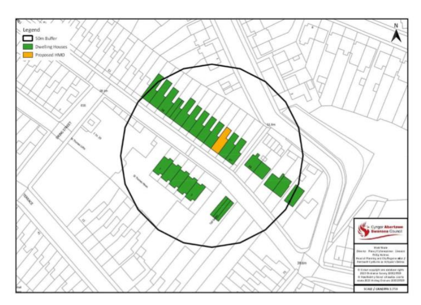
Figure 1 - HMO Concentration Radius Test

Within a 50 metre radius of the application property there are 26 residential units and according to my records no properties are existing HMOs. If the application property was approved for a HMO (Class C4) use I have calculated that on this basis the concentration percentage would be 3.85% within the 50m radius and therefore would be below the 10% threshold. See Figure 1 below: